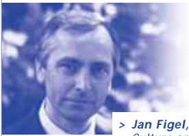
> Jan Figel, Commissioner for Education, Culture and Multilingualism

A key feature of higher education in Europe, when compared with other continents, is the intensity of networking between universities. As a result of nearly 20 years of cooperation, and exchanges across Europe, which would not have been possible without strong networks and consortia underpinning them, European universities have built up a unique experience of multilateral collaboration which is a key asset for their future. University networks are the bridges and guarantors of diversity in the Europe of knowledge and in this era of globalisation.