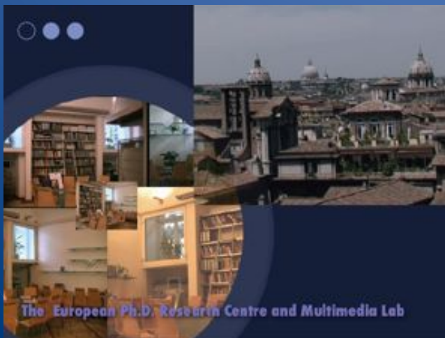
The European Ph.D. Research Centre and Multimedia Lab