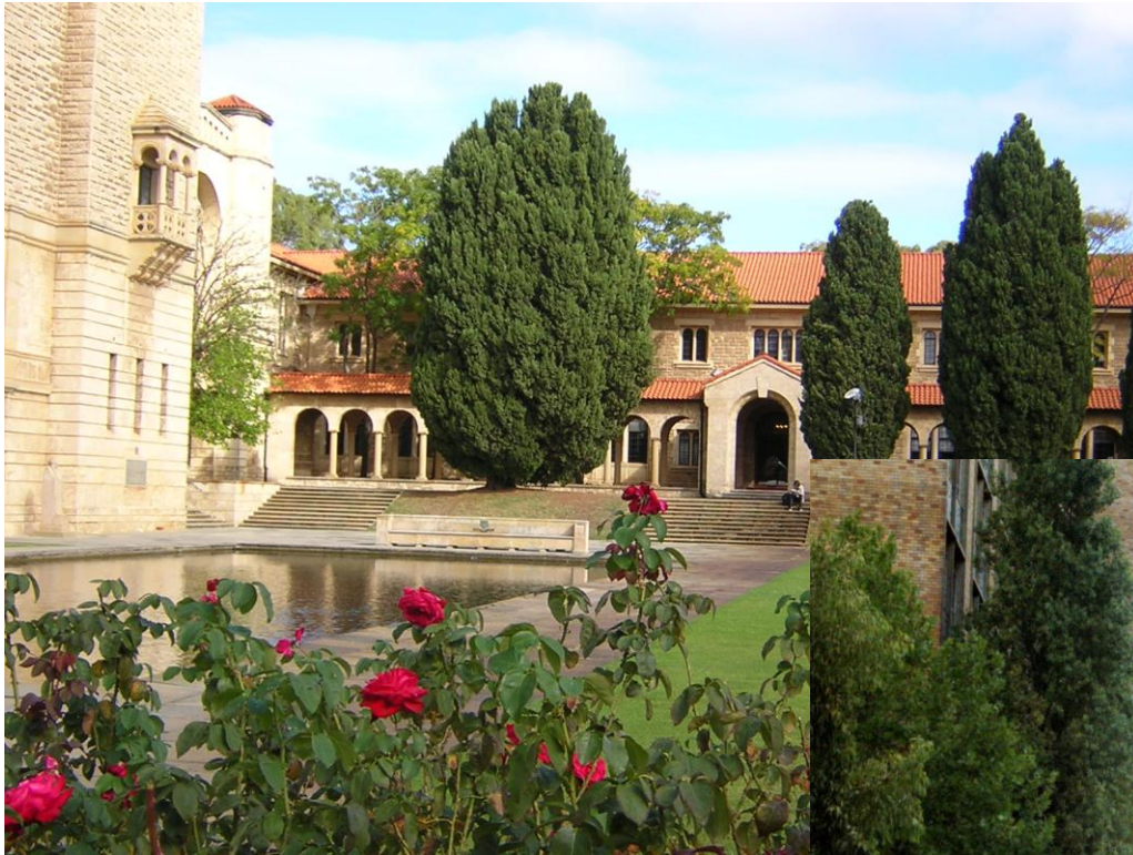
University of Western Australia, Perth