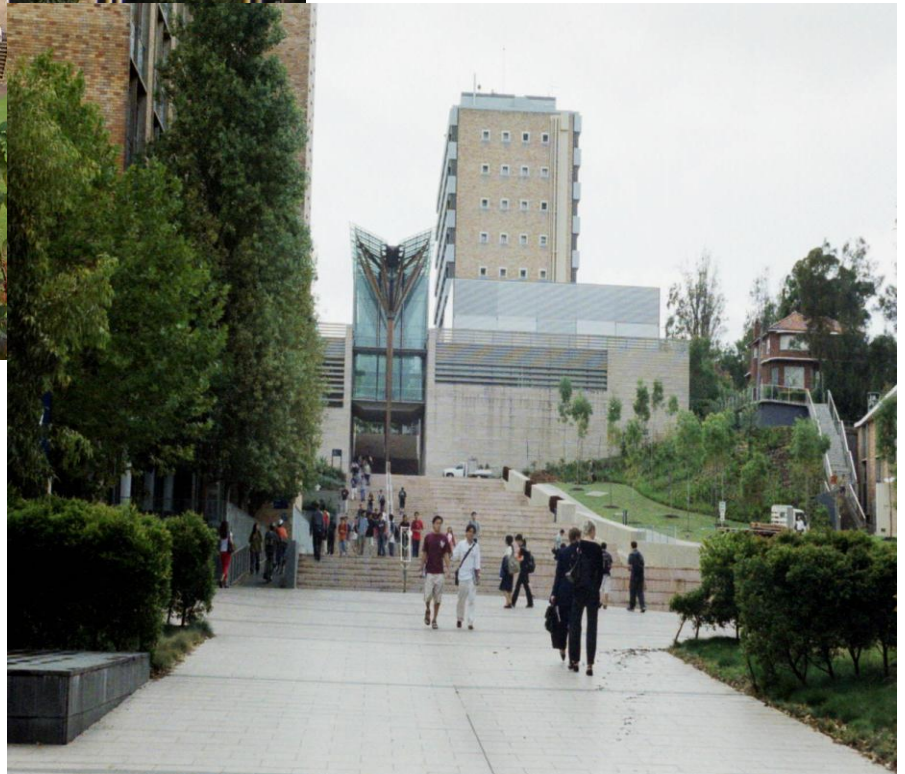
University of New South Wales, Sydney