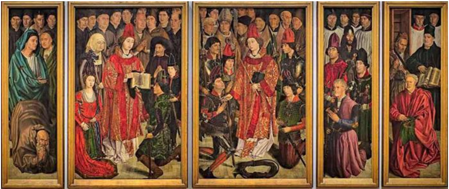
Painéis de São Vicente de Fora. Pintura portuguesa do séc. XV, óleo sobre tela.