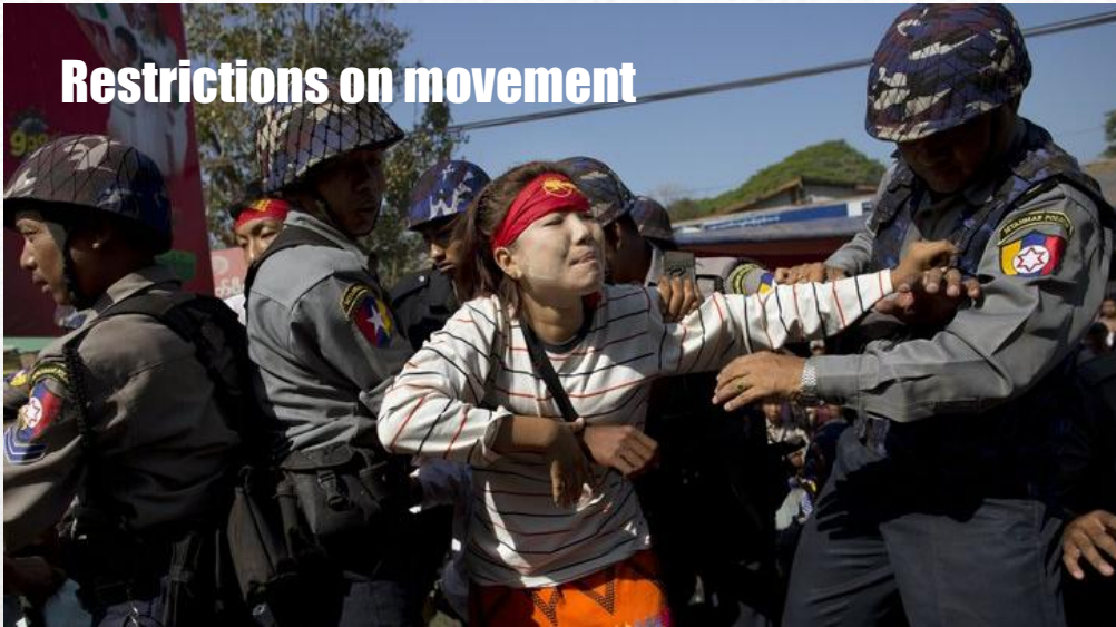
Restrictions on movement