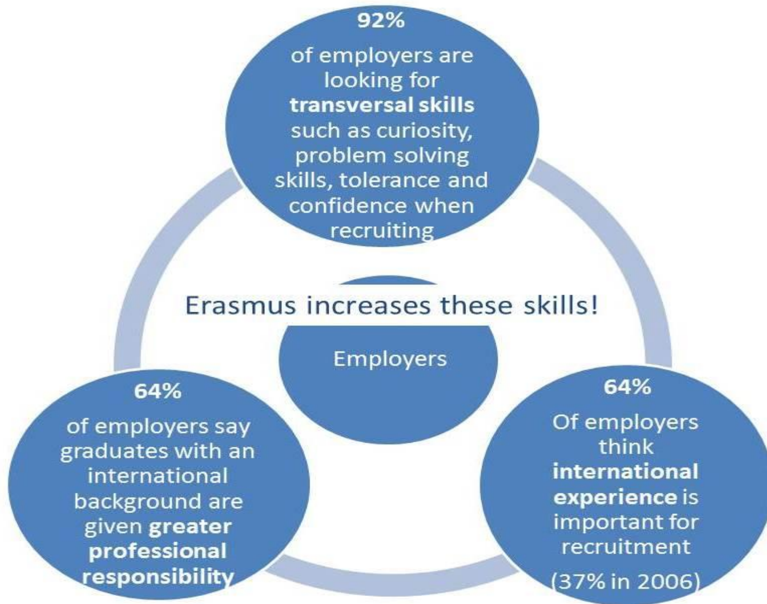
Figures taken from the Erasmus Impact Study