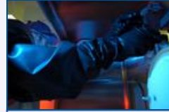
Premises and equipment