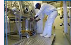
Site Master File