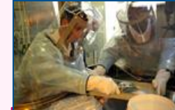
Quality Risk Management