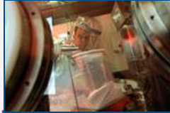
Pharmaceutical Quality System