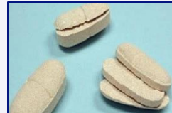
Complaints and product recall