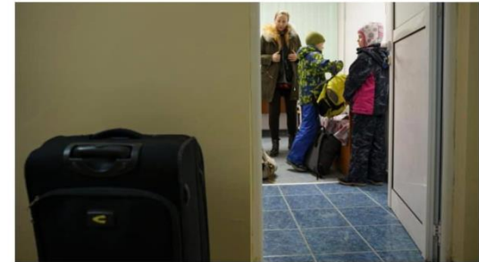
As of 14 March, over 3,000 people, including 65 children, had a refuge on campus