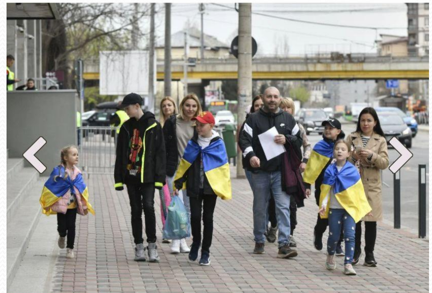
Foto 4/17 Dinamo Kiev - Sporting, Youth League, pe Giulești 07.04.2022