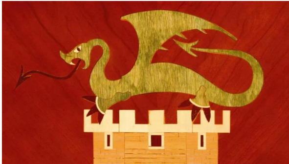
The dragon is the symbol of Ljubljana and has pride of place on the city coat of arms and on the Dragon Bridge

Legend has it that Ljubljana was founded by Jason, the hero of Greek mythology who stole the golden fleece from King Aeëtes and then fled aboard the Argo with his comrades, known as the Argonauts, across the Black Sea and up the Danube and the Sava until they reached the Ljubljanica. There they dismantled their ship in order to carry it overland to the Adriatic coast, where they rebuilt the vessel and set sail back to Greece. On their way to the coast, they stopped at a large lake in the marshes near the