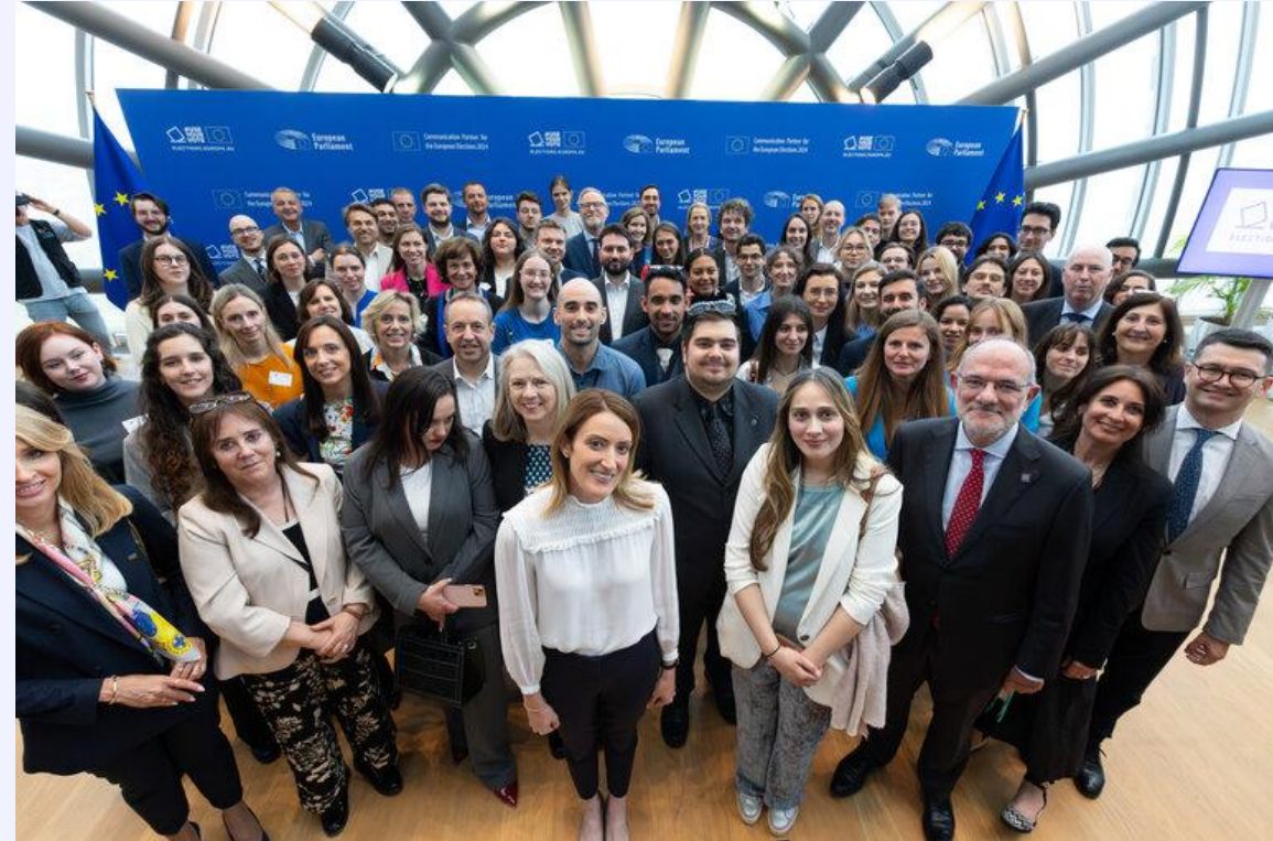
Meeting between the President of the European Parliament, Roberta Metsola, and the dissemination partners for the EU elections 2024 | May 2024