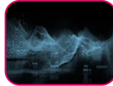
AI & Emerging Technology