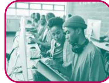
200 Graduate Students