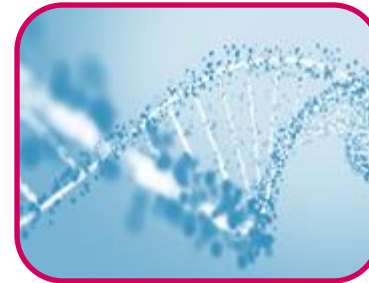
AI & Science