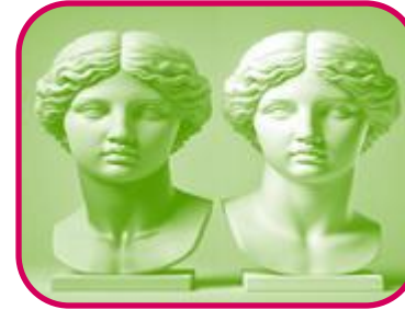
AI & Society