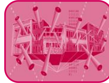
9 Research Centers