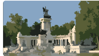
El Retiro Park esmadrid.com/en/retiro-park A UNESCO-listed urban oasis perfect for a relaxing afternoon by the lake.