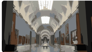
The Prado Museum (Museo del Prado) museodelprado.es Home to the world's finest collection of European art, featuring Velázquez and Goya.