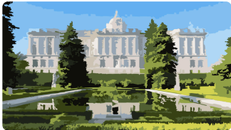
The Royal Palace (Palacio Real) patrimoniacional.es Western Europe's largest palace and a masterclass in Baroque architecture.