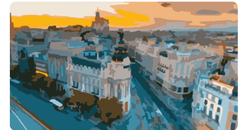
Gran Vía & Sol turismomadrid.es The "Times Square" of Madrid—famous for shopping, theaters, and the iconic "Kilometer Zero."