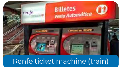
Renfe ticket machine (train)

From T4, take line C-1 to "Chamartin" or "Nuevos Ministerios" and transfer to lines C-2, C-7, or C-8 toward Alcala de Henares/Guadalajara (approx €6.00 - €10.00) Connects Alcala to Madrid (Atocha, Recoletos, Chamartin) every 10-15 minutes. The trip to Madrid takes approximately 45-50 minutes.